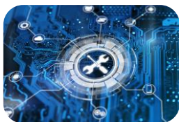
Business & Industrial Services